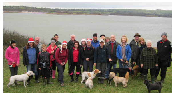
Boxing Day Walk