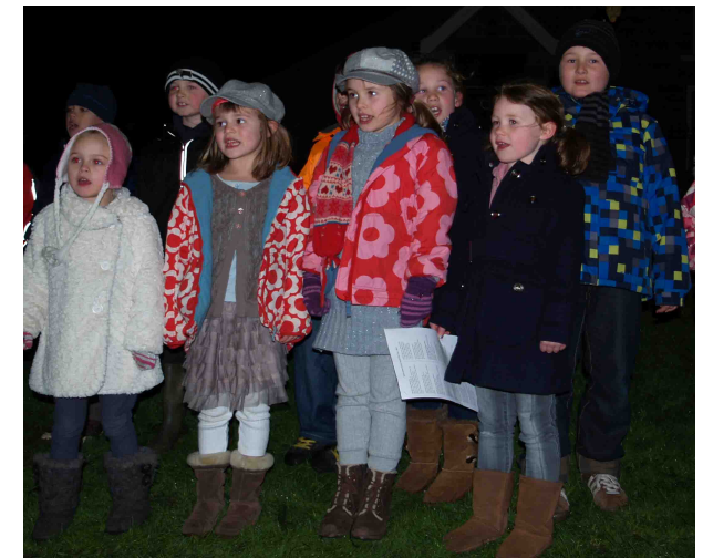
School choir singing carols around the tree