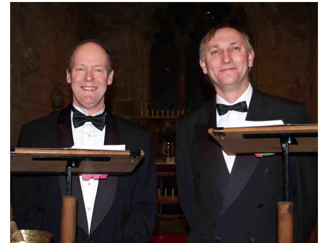
'Christmas Carol' reading in the Church

Here are a few photos for those who couldn't get to the events.