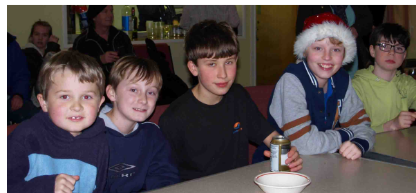
Film night at the Village Hall